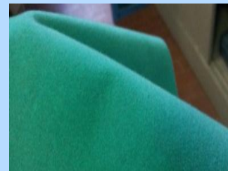
Flocking - Flocatura Woven covering fabrics