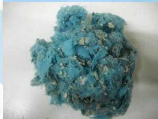
Fraying - sfilacciatura soundproofing panels

TTR is decommissioned clean and sanitized by microbiological agents