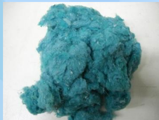
Garnetting - garnettatura automotive padding